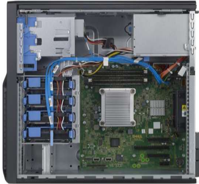
Figure 4. Internal-Chassis View

Figure 4 shows the internal-chassis view of the PowerEdge T110 II.