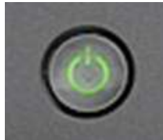
Figure 5. Power Button

All Dell PowerEdge servers have a green LED integrated in the power button which indicates the system's power state. Figure 5 shows the power button.