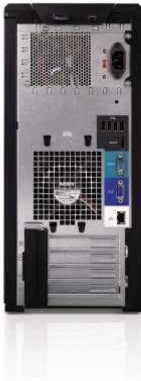
Figure 3. Back-Panel View

Figure 3 shows the back-panel view of the PowerEdge T110 II.