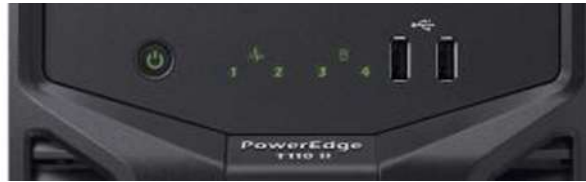
Figure 6. LED Control Panel

Figure 6 shows the LED control panel located on the front of the T110 II system.