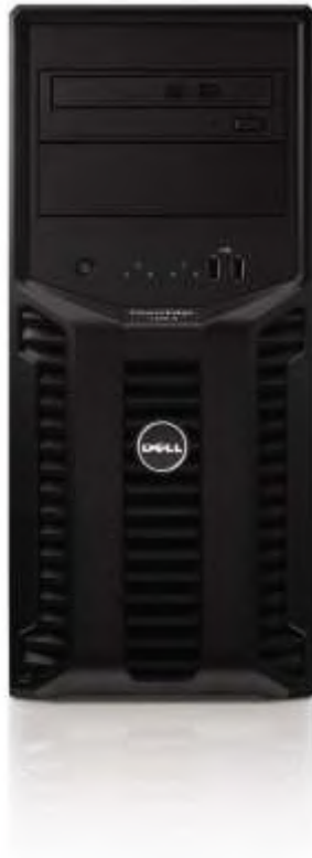
Figure 2. Front-Panel View

Figure 2 shows the front-panel view of the PowerEdge T110 II.