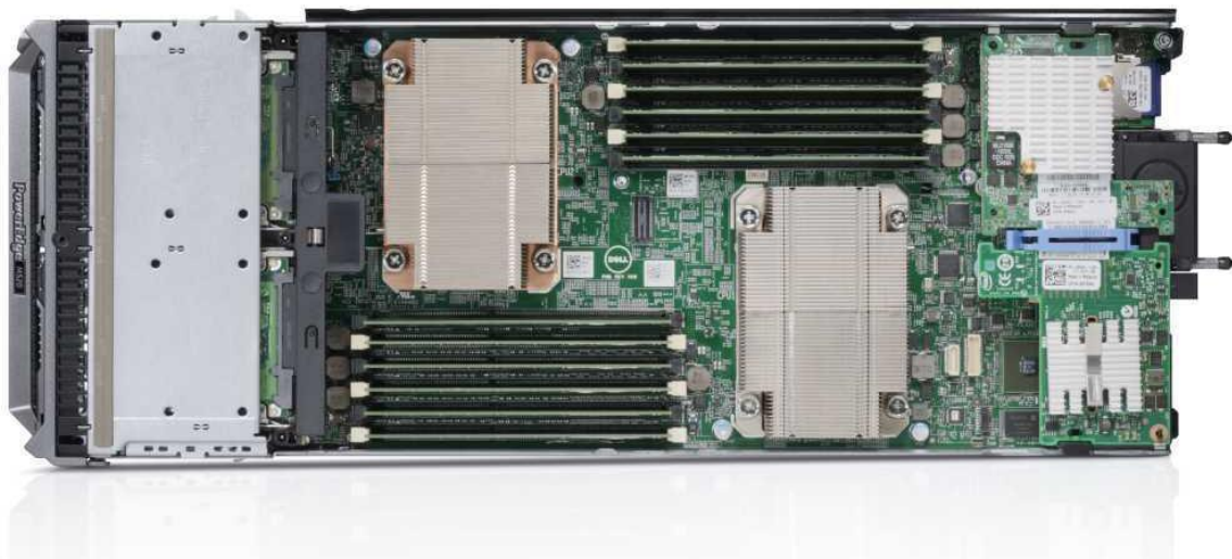
Figure 3. M520 internal module view

For additional system views, see the Dell PowerEdge M520 Systems Owner's Manual on Dell.com/Support/Manuals .