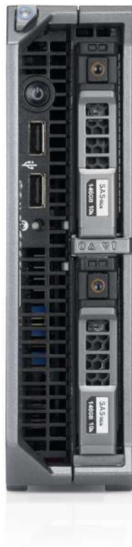
Figure 1. M520 front view

The chassis design of the M520 is optimized for easy access to components and for airflow for effective and efficient cooling. Figure 2 shows the M1000e chassis enclosure populated with M520 modules.