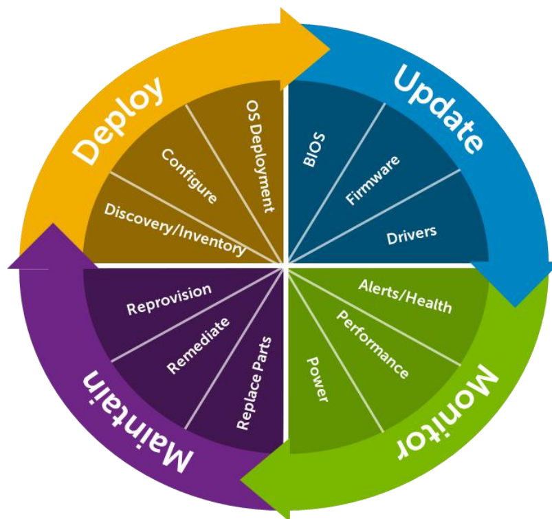
Figure 6. Systems management server lifecycle

Dell OpenManage systems management is centered on automating the server management lifecycle — deploy, update, monitor and maintain. To manage an infrastructure properly and efficiently, you must perform all of these functions easily and quickly. iDRAC7 with Lifecycle Controller technology provides you with these intelligent capabilities embedded within the server infrastructure. This allows you to invest more time and energy on business improvements and less on maintenance. Figure 6 illustrates the various operations that can be performed during the server's lifecycle.