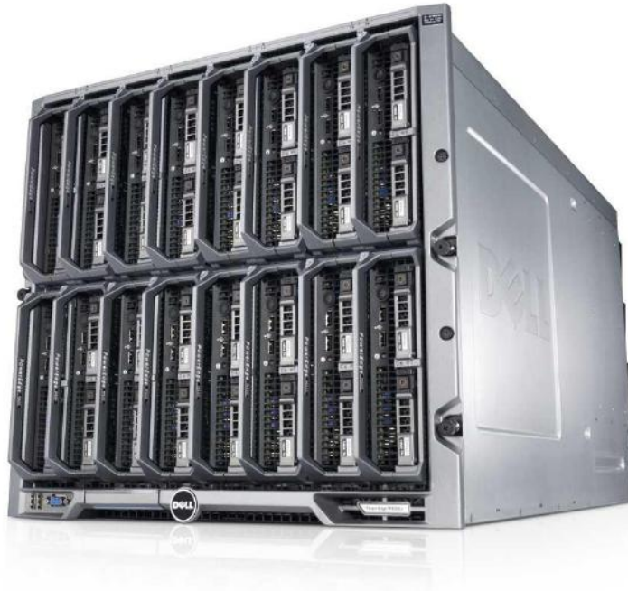
Figure 2. M1000e chassis enclosure with M520 blades

The M520 module shown in Figure 3 supports up to 12 DIMMS, two processors and many other features described in this guide.