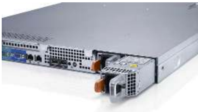
Figure 7. 350W power supply unit

The PowerEdge R320 supports up to two AC with 1+1 redundancy, auto-sensing, and auto-switching capability.