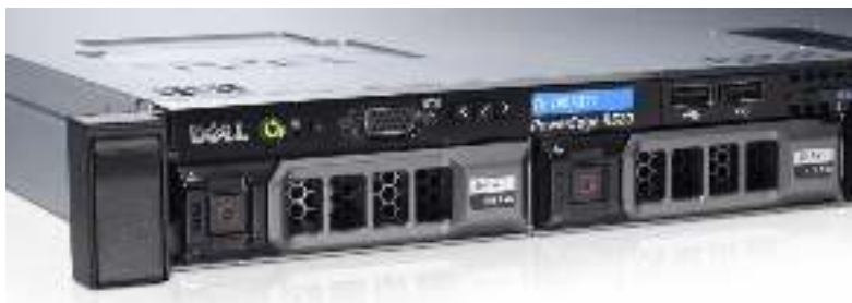
Figure 5. LCD control panel

The R320 control panel is located on the front of the chassis as shown in Figure 5. For more information about the LCD control panel, see the Dell PowerEdge R320 Systems Owner's Manual on Support.Dell.com/Manuals .