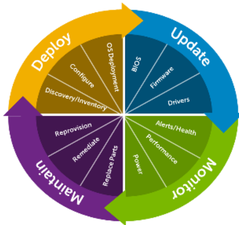
Figure 11. Systems management server lifecycle

Table 24 lists the products that are available for one-to-one and one-to-many operations, and when they are used in the server’s lifecycle: