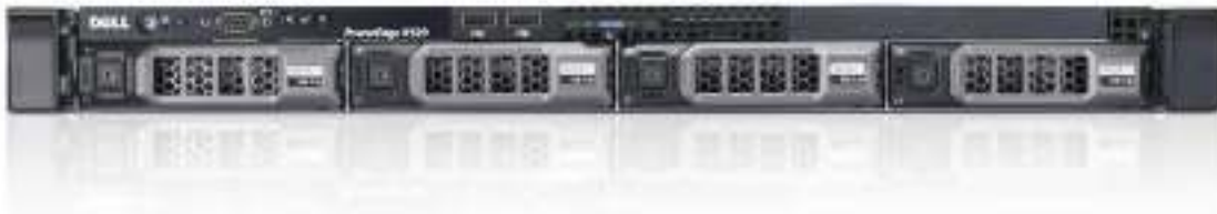
Figure 1. Front view without bezel

Figure 2 shows the optional lockable bezel on the front of the R320 chassis.