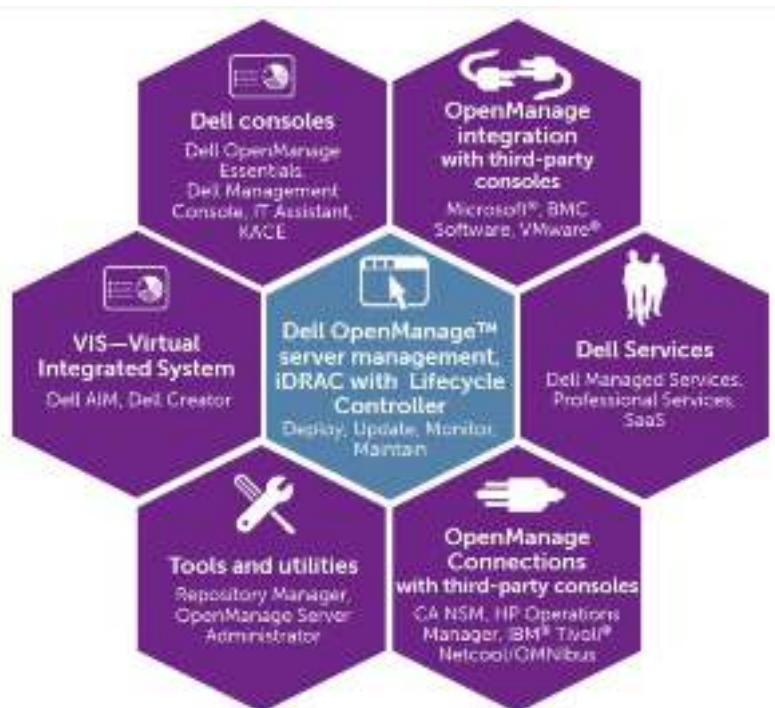
Figure 10. Dell systems management solutions

Dell systems management solutions include a wide variety of tools, products, and services that enable you to leverage an existing systems management framework. As shown in Figure 10, Dell systems management solutions are centered around OpenManage server management, featuring iDRAC with Lifecycle Controller.