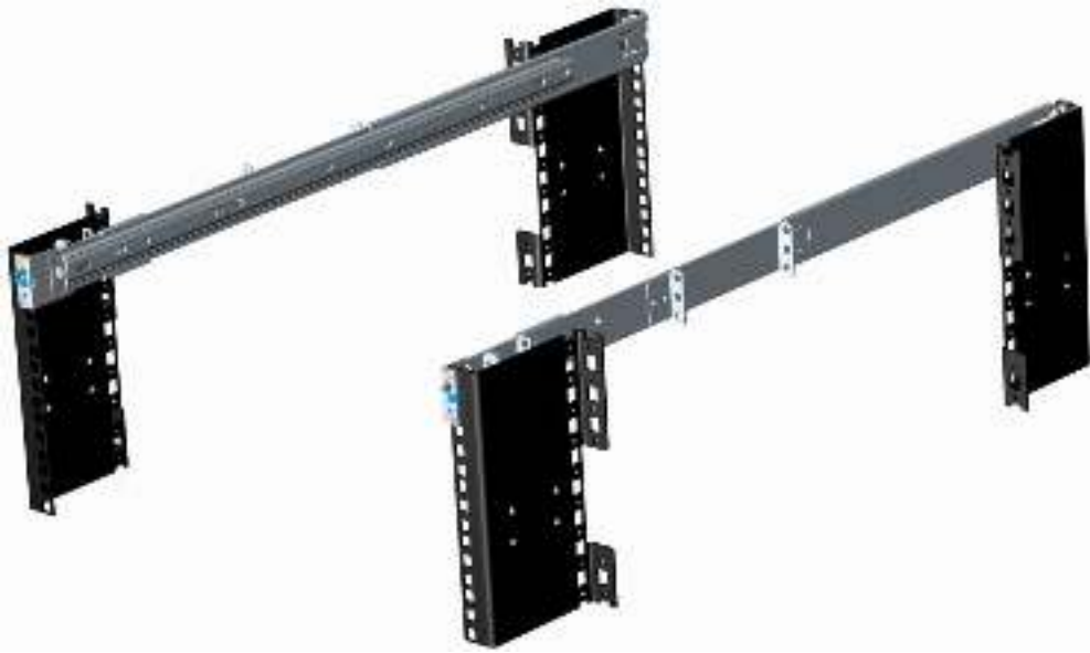
Figure 9. Static rails

One key factor in selecting the proper rails is identifying the type of rack in which they will be installed. Both the sliding rails and the static rails support tool-less mounting in 19"-wide, EIA-310-E compliant square hole and unthreaded round hole 4-post racks. Both also support tool-ed mounting in threaded hole 4-post racks, but only the static rails, as the more universal solution, support mounting in 2-post (Telco) racks.