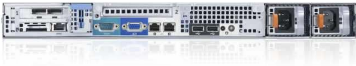
Figure 3. Back view

The chassis design of the R320 is optimized for easy access to components and for airflow for effective and efficient cooling. The R320 supports up to 6 DIMMs, 1 processor, hot-plug redundant power supplies, and many other components and features described in this guide.