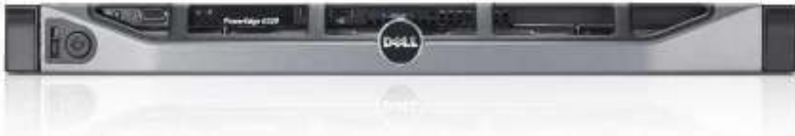
Figure 2. Front view with bezel

Figure 3 shows the features on the back panel of the R320 including USB connectors, Ethernet connectors, serial connector, video connector, PCIe slots, power supplies, and many other components and features described in this guide.